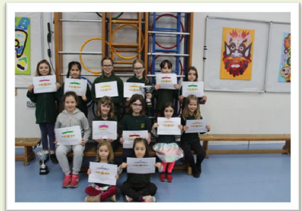
Picture of our Star of the Week children

The winners of the best attendance trophy for this week are Y5 Saffron, Y4 Fuchsia and Y4 Cerise with 98.7% attendance. Whole school attendance from 3 rd September until 6 th February 2020 is 96%.