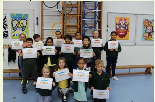
Picture of our Star of the Week children

The winners of the best punctuality trophy for this week are Y1 Lavender and Reception Aqua. The winners of the best attendance trophy for this week is Y4 Cerise with 100% attendance. Whole school attendance from 3 rd September until 20 th September 2019 is 98%.