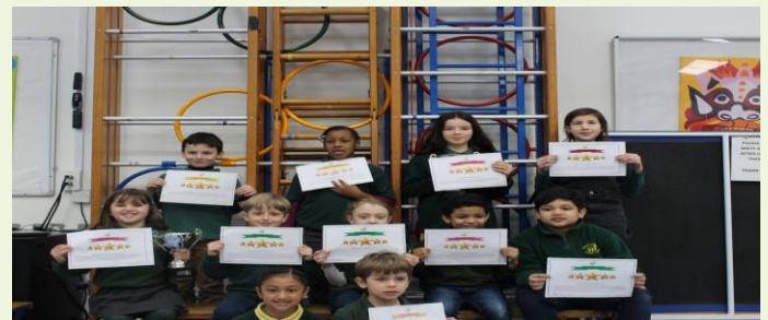
Picture of our Star of the Week children

Whole school attendance from 3 September until 14 th February 2019 is 97%.