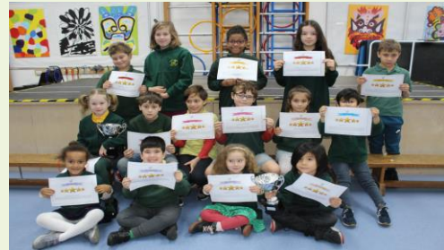
Picture of our Star of the Week children

The winners of the best punctuality trophy for this week are Y1 Violet and Reception Aqua with no late marks; The winner of the best attendance trophy for this week is Y2 Peach with 100% attendance; Whole school attendance from 3 September until 30 th November 2018 is 97.1%.