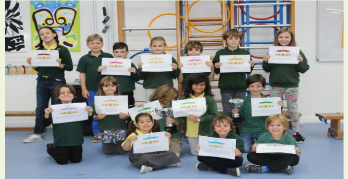
Picture of our Star of the Week children

Whole school attendance from 3 September until 28 September 2018 is 98.2%