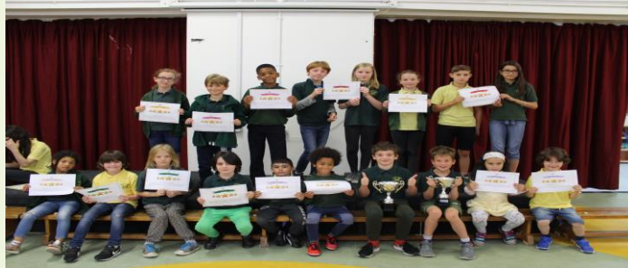
Picture of our stars of the week children