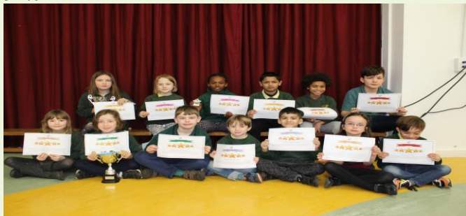
Picture of our Star of the Week children

The winner of the best punctuality trophy for this week are: Year 2 Peach and Year 3 Emerald with no late marks The winner of the best attendance trophy for this week is: Year 5 Saffron with 100% attendance Whole school attendance from 5 September until 3 rd February is 96.7%